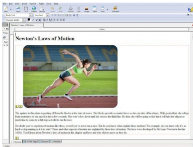
Figure 2. Screenshot of edited physical science e-book. This figure shows how preservice teachers can edit text to meet the specific needs of their classrooms.

Finally, the preservice teachers described explicitly how they incorporated the e-reader and e-text into their lessons. As a reflective component, they justified their e-text and pedagogical choices to explain how they met the needs of their students and created relevant readings for their lesson topic. This requirement is outlined in our rubric (see Figure 3).