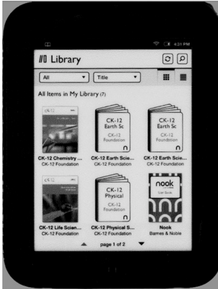
Figure 4. Screen capture of science e-books from CK-12 on a Nook Simple Touch.

In the postinstructional survey, 50% of preservice teachers reported liking the portability (e.g., size and weight) and the ease of loading documents. Fifty percent of the preservice teachers also shared functionality as an advantage of e-readers and e-text to address the needs of their students. This functionality included bookmarking, highlighting, note taking, audio, and built-in dictionary features, which was not noted in the preinstructional survey. In the postinstructional survey, they described some of the benefits of using the technology in their classrooms: