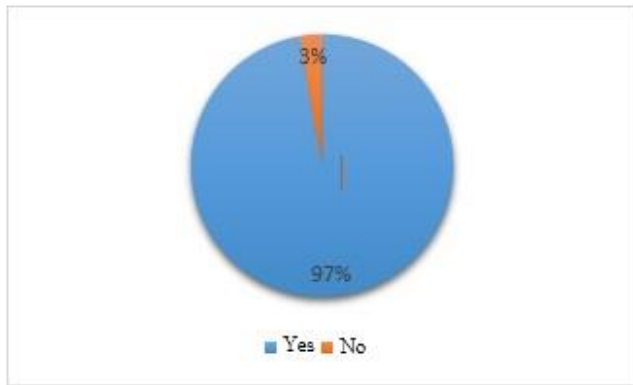
Fig 1. Percentage of lecturers who compile RPS

The majority of lecturers who teach MKU courses at Tidar University have prepared RPS courses. Although there are several courses that are the same, the lecturers are still involved in the preparation of the RPS. In this case, as many as 3% of lecturers who did not participate in the preparation of the RPS since they have no free time due to busy work.