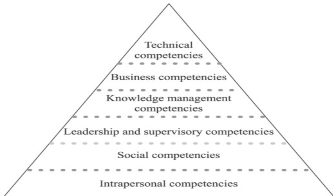
Figure 1: Pyramid Competency Model (Viitala, 2005)